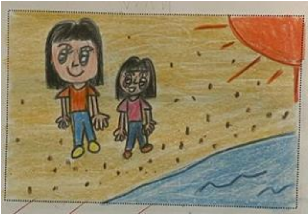
Mum and Mandy are at the beach in the morning.