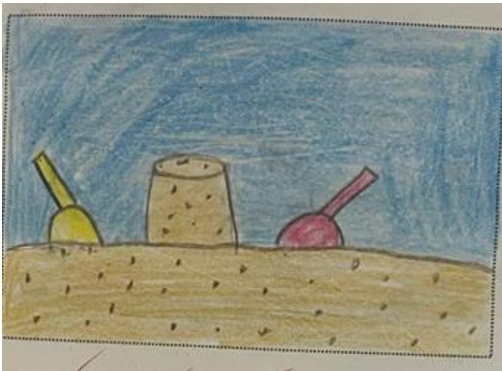
They are digging in the sand.